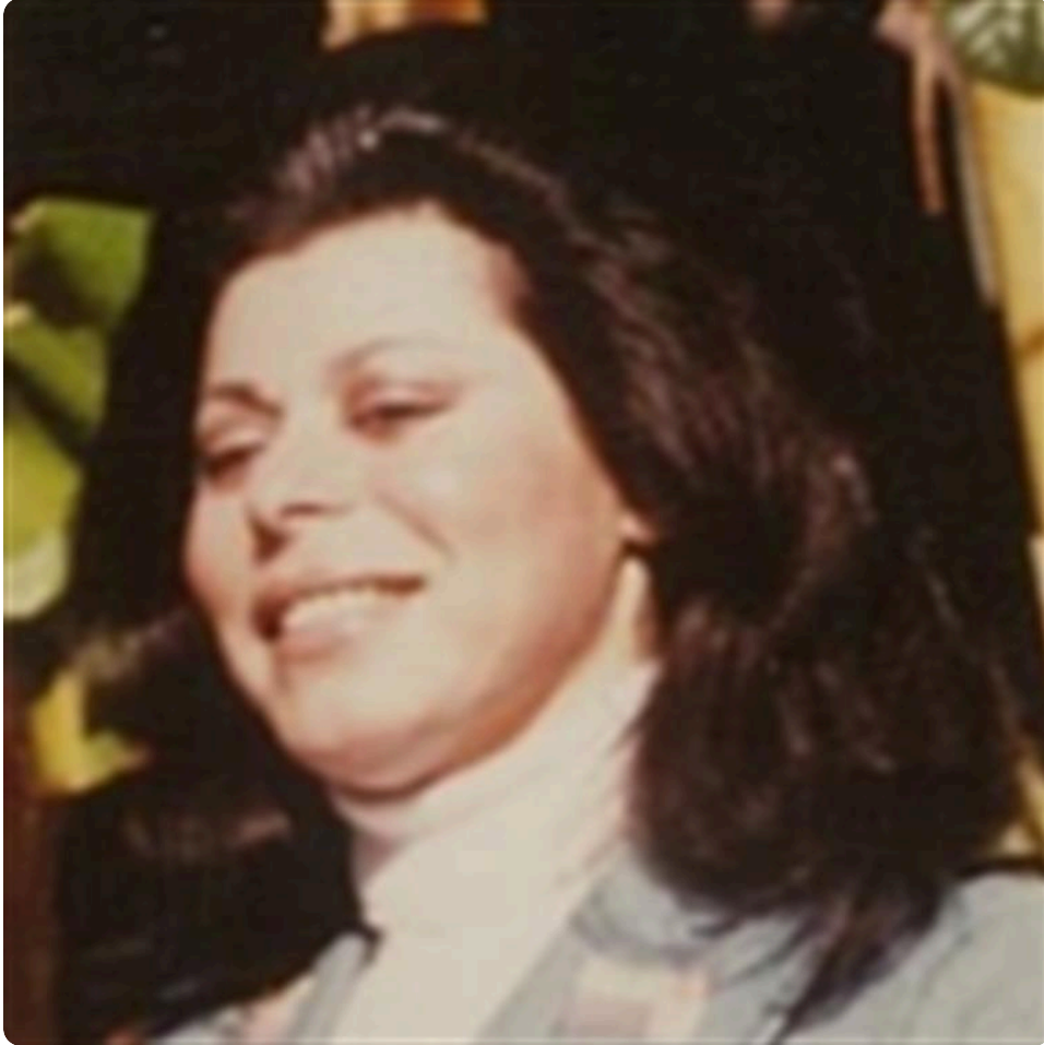
Forever young and beautiful